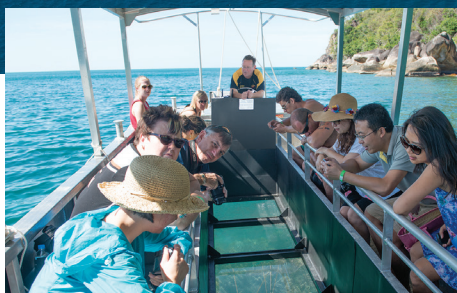
Glass bottom boat with commentary