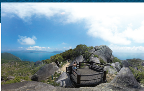
Walk to the Summit