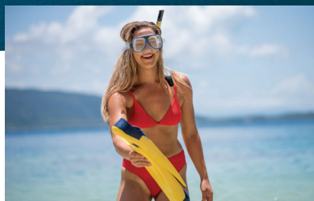
Snorkel directly from the beach