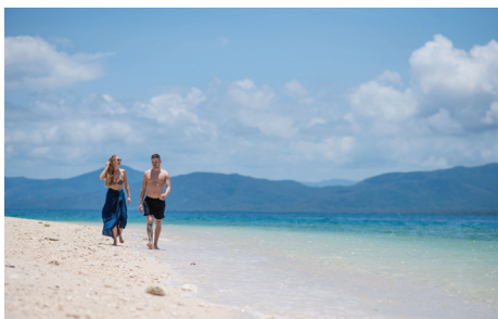
The iconic Nudey Beach