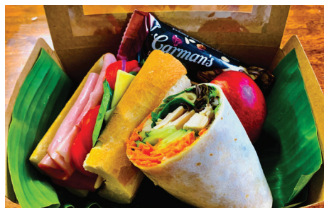
Enjoy a picnic lunch