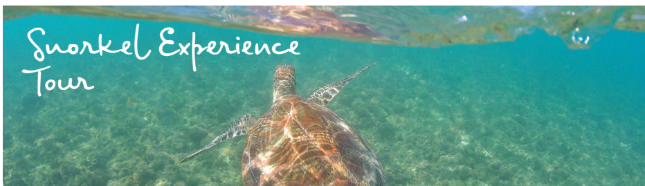
Snorkel Experience Tour

If you are a first-time snorkeller or newer to the sport and would appreciate joining an intimate group with our marine biologist, this is the tour for you. Explore fringing reef straight off the beach with Fitzroy islands stunning rainforest as your background.