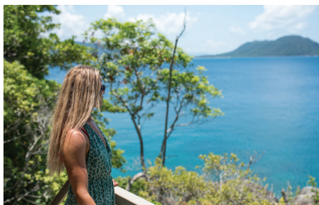
Rainforest walking tracks