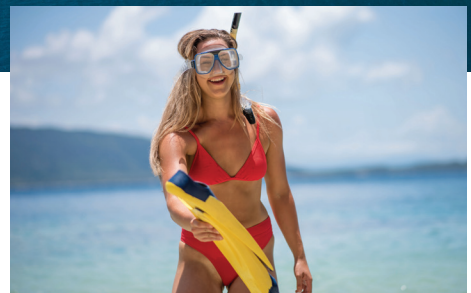
Snorkel directly from the beach