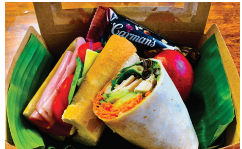
Enjoy a picnic lunch