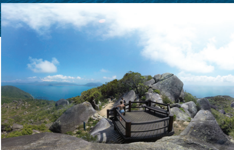
Walk to the Summit