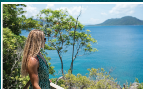
Rainforest walking tracks