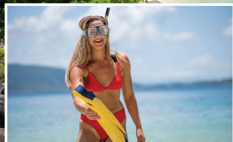
Snorkel directly from the beach