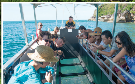
Glass bottom boat with commentary