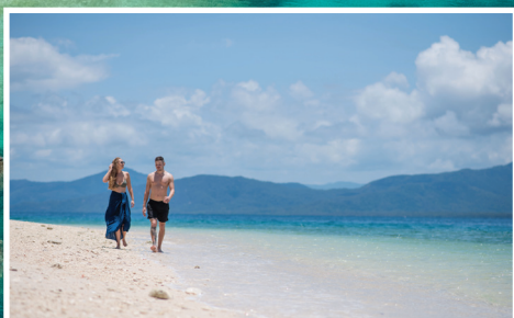
The iconic Nudey Beach