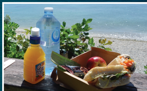
Enjoy a picnic lunch