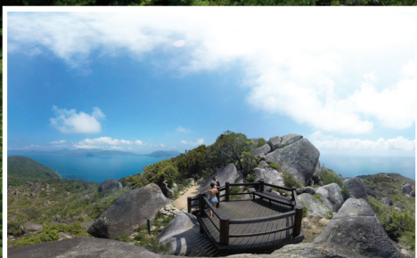
Walk to the Summit